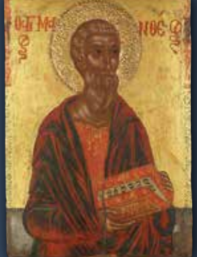
1. Architrave icon of St Peter, 17th c. (MAG Collection) 2. Architrave icon St Mathew, 17th c. (MBC Collection)